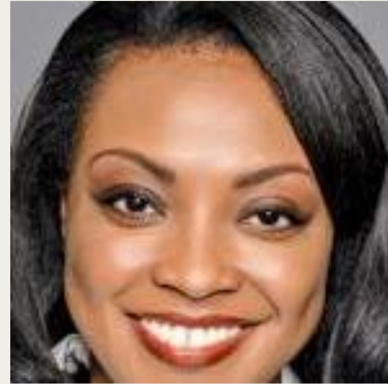
House Minority Leader Pro Tempore

District Covers Parts of Hillsborough County