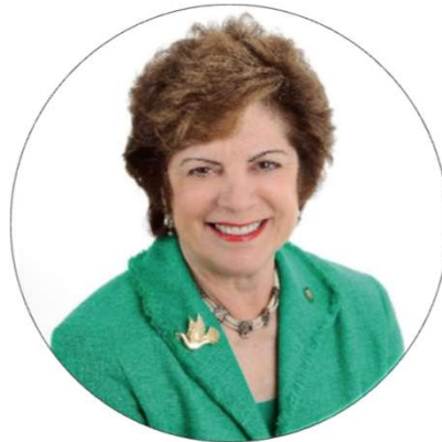
The Honorable Nan Rich Mayor, Broward County Former State Senator, District 34 Chair, Coordinating Council of Broward County & Broward Behavioral Health Coalition