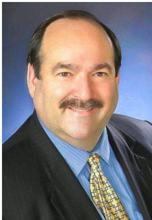
The Honorable Steve Geller Chair, SFRPC Broward County Commissioner, District 5 Former State Senator