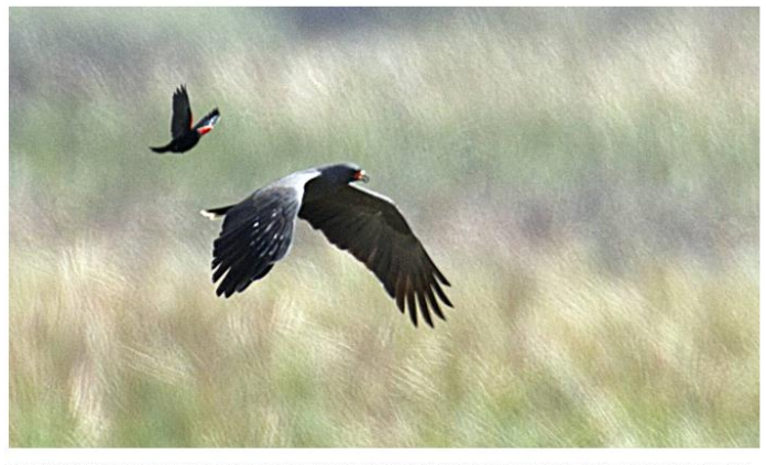
The Bird Basin wetlands once provided habitat for about 100 different species, including snail kites like the one pictured here, eagles and ospreys.

But critics say there's a host of reasons why the extension is shortsighted. It will further damage an area long eyed for restoration — the 1990 county study called it "biologically productive, albeit stressed," where bobcats, alligators, eagles and 100 different species roamed among rare native plants including wild coco and tiny orchids. An environmental study to narrow alternative routes has been completed, but a fuller study looking at overall impacts and required by the U.S. Corps of Army Engineers to pave over wetlands has not yet been done.