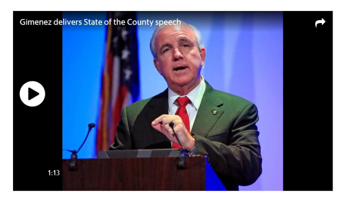
The speech touted the county's declining unemployment rate and record traffic levels at Miami International Airport and PortMiami, while promising more efforts on public safety, economic development, parks and solar power. The speech touted the cou

"There is no question something has to be done," she said. "But my hope is the path of the project could be moved."