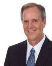
Beam Furr Broward County Vice Mayor