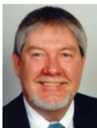
George Neugent Monroe County Mayor