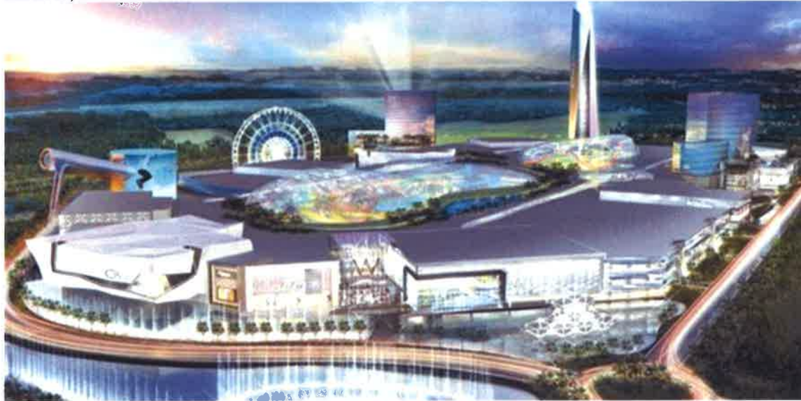
Rendering of American Dream Miami

The South Florida Regional Planning Council voted Friday to submit to state regulators the developer's application to build the proposed American Dream Miami shopping mall in north Miami-Dade County.