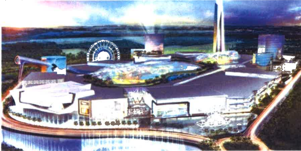
Rendering of American Dream Miami

A lawyer representing Triple Five, the developer of American Dream Miami, said the mega-mall project is advancing while Triple Five tries to resume construction of a New Jersey mall with the same name.