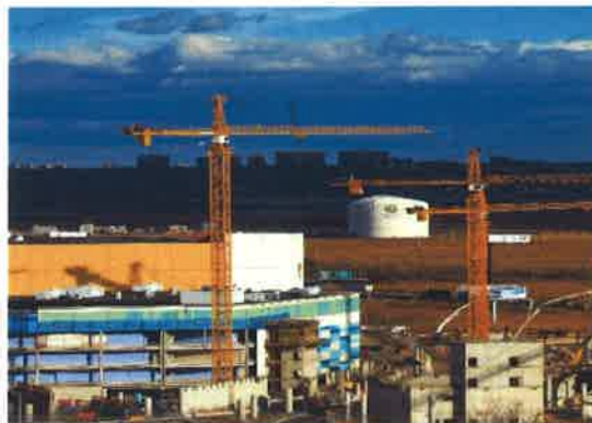
The American Dream construction site in New Jersey.