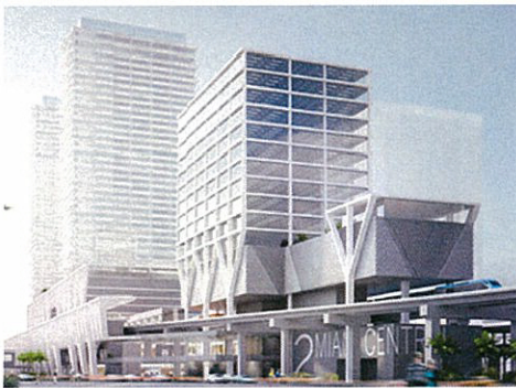
Rendering of MiamiCentral Station in Downtown Miami

With All Aboard Florida's Brightline and Tri-Rail's Downtown Miami Link projects both quickly moving forward to a scheduled 2017 opening, now is the time to build upon the momentum of MiamiCentral Station with