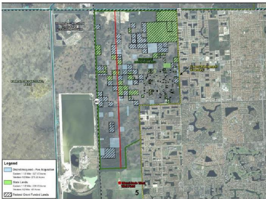
Much of the land in the Bird Drive Basin is already publicly owned, purchased with money intended for Everglades restoration.