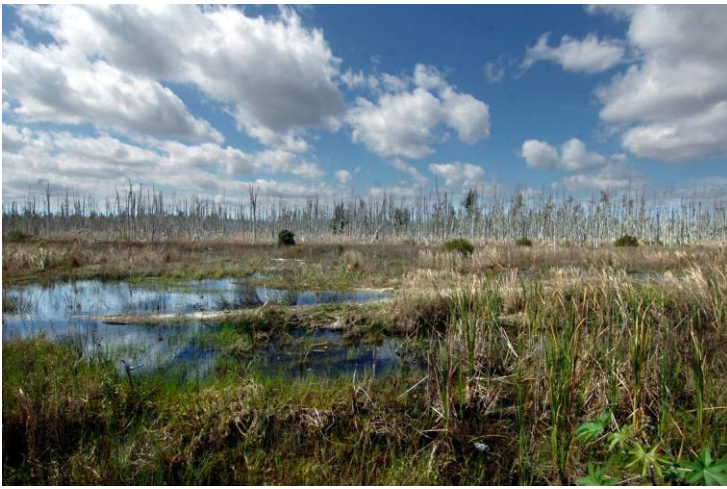
Miami-Dade County wants to extend the Dolphin Expressway 13 miles across wetlands, shown here at the corner of Southwest 157th Avenue and the Tamiami Trail in 2012.

Tentative proposals take the expressway, also known as State Road 836, first across the Pennsuco wetlands, another sensitive area outside the urban boundary that's being restored to make up for marshes destroyed by rock mining and other development. It then veers south through the center of the basin, a fragment of the shrinking Everglades and a rare empty swath of land critical to replenishing the shallow aquifer that supplies the county's drinking water. It's also home to a menagerie of native animals, wading birds and rare