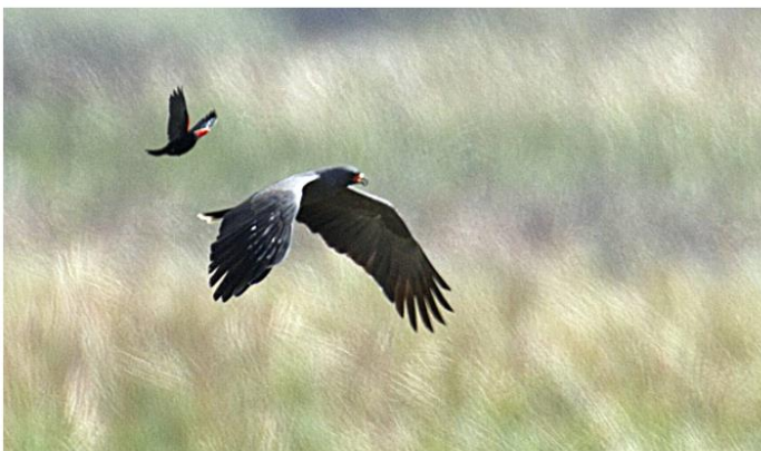
The Bird Basin wetlands once provided habitat for about 100 different species, including snail kites like the one pictured here, eagles and ospreys.

But critics say there's a host of reasons why the extension is shortsighted. It will further damage an area long eyed for restoration — the 1990 county study called it "biologically productive, albeit stressed," where bobcats, alligators, eagles and 100 different species roamed among rare native plants including wild coco and tiny orchids. An environmental study to narrow alternative routes has been completed, but a fuller study looking at overall impacts and required by the U.S. Corps of Army Engineers to pave over wetlands has not yet been done.